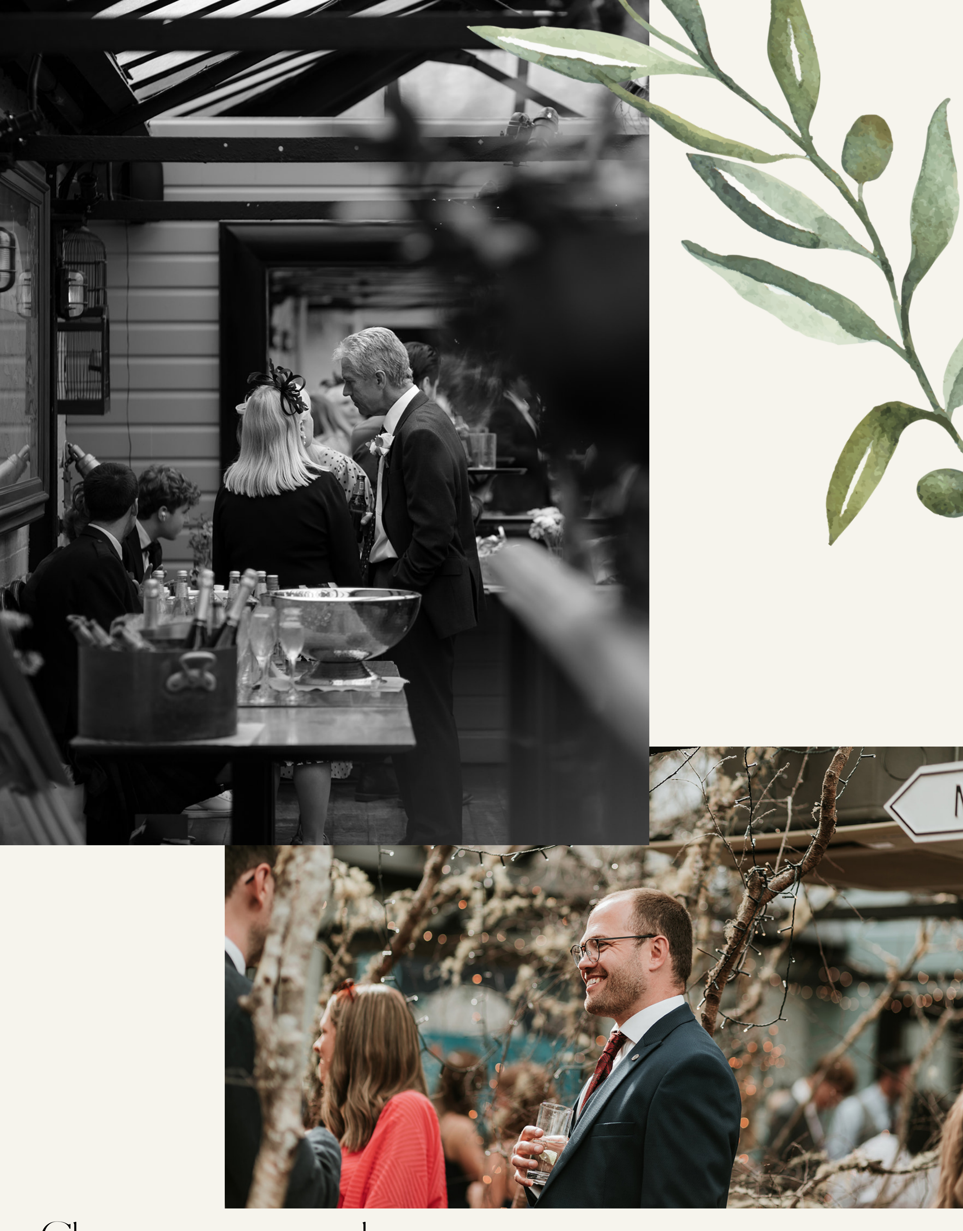
Champagne and canapes ...